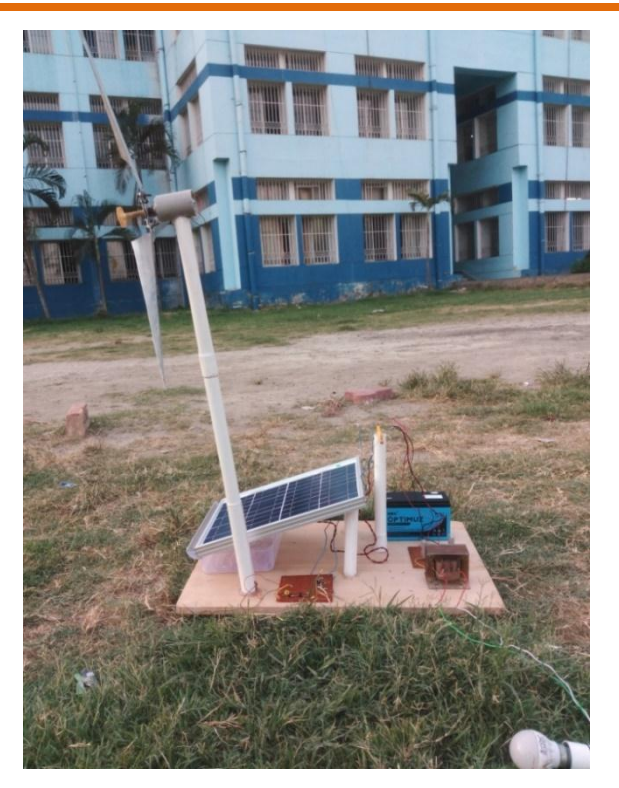
Fig 3: Experimental Setup