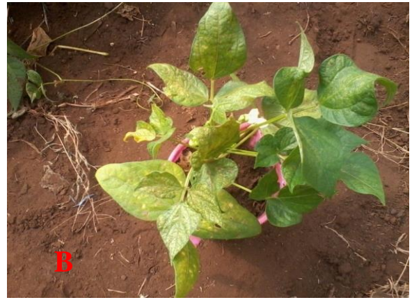
Figure 2a: Hypersensitive reaction observed on inoculated leaves of KATB1 bean cultivar in greenhouse. (Resulting into leaf mosaic and yellowing of leaves due to inoculation with BCMV). B: Chinese black kidney bean variety was more tolerant to inoculation with BCMV.