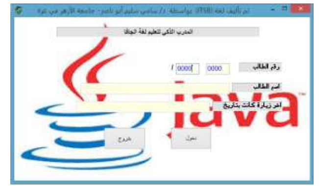
Figure 2: Student Login Form.

Here some of screenshots of teacher interface and student interface. As shown in Fig2 – Fig9.