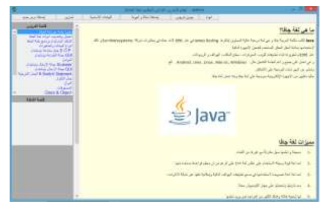
Figure 3: Student lessons and examples form.