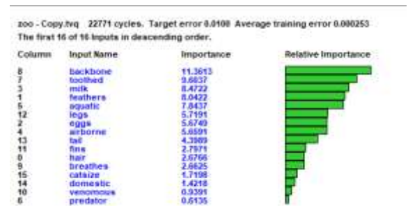
Figure 3: Input variables importance

The learning algorithm was able to determine the input variables importance as shown in figure (3).