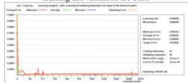
Figure 4: Error rates vs. learning cycles

Moreover, figure (4) shows the errors rates information after learning and validation are done.