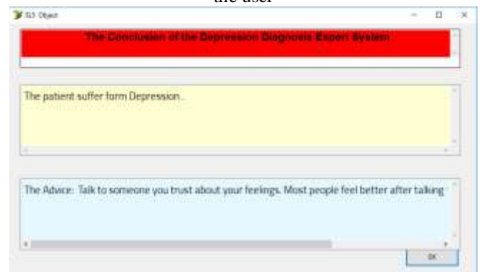
Figure 4: The figure shows diagnosis and recommendation of the expert system