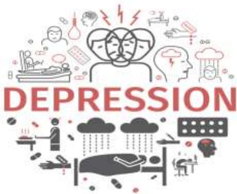
Figure 1: The figure presents the situation of depressed person

While we all feel sad, moody or low from time to time, some people experience these feelings intensely, for long periods of time (weeks, months or even years) and sometimes without any apparent reason. Depression is more than just a low mood, it's a serious condition that affects your physical and mental health.