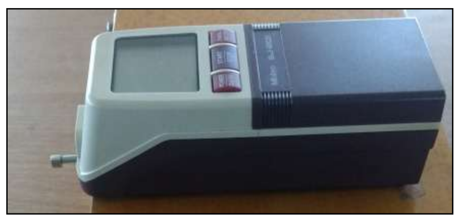
FIGURE.2 Surface roughness measurements

The surface roughness of the titanium alloy is measured by the help of surface tester which measures the surface at the different position of the material at the angle of 1200 at the circumference of the 60mm round bar immediately after the turning for every operations.