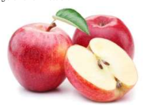
Figure 1: apple fruit

the apple contribute to a healthful lifestyle, including preventing osteoporosis, maintaining heart health, and reducing the risk of infection.