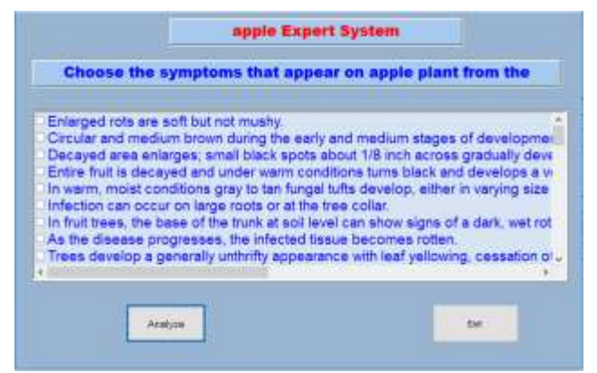
Figure 3 shows a sample dialogue between the expert system and the user.

The proposed expert system performs diagnosis for twelfth apple diseases by displaying the symptoms. The proposed expert system will ask the user to choose the correct Symptoms of apple disease in each screen. At the end of the dialogue session, the proposed expert system provides the diagnosis and recommendation of the disease to the user [3-8].