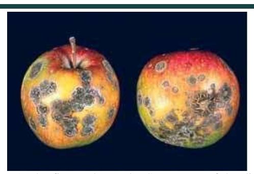
Figure 5: The figure shows the Symptoms of the disease Apple scab