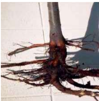
Figure 8: The figure shows the Symptoms of the disease \operatorname{Collar} rot .