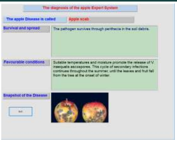
Figure 4 shows how the users get the diagnosis and recommendation