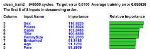
Figure 3: Effective of input valuables to Titanic Survivors