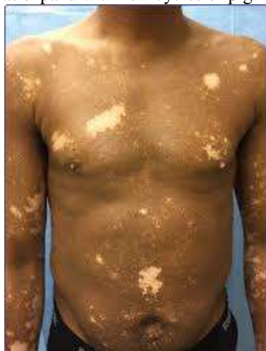
Image: Person body with Non-Segmental Vitiligo

It is more common and affects both sides of the body. It usually begins with a short-lived burst of discoloration on the hands, feet, or face. The affected areas expand with new cycles of pigment loss that occur throughout the person's life.