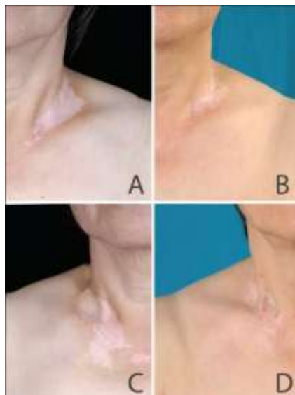
Image: Tacrolimus-treated side at (A) baseline and (B) 6 months' follow-up. Mometasone furoate cream-treated side at (C) baseline and (D) 6 months' follow-up.

STATISTICAL ANALYSIS: All statistical calculations were performed by the statistical software package SPSS, version 17.0 (SPSS Inc., Chicago, IL, USA). The grading of improvements by two dermatologists was subjected to inter-rated reliability assessment and paired sample t test. Descriptive statistics were assessed using the Chi-square test.