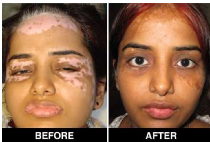
Image: Before treatment picture and after treatment picture