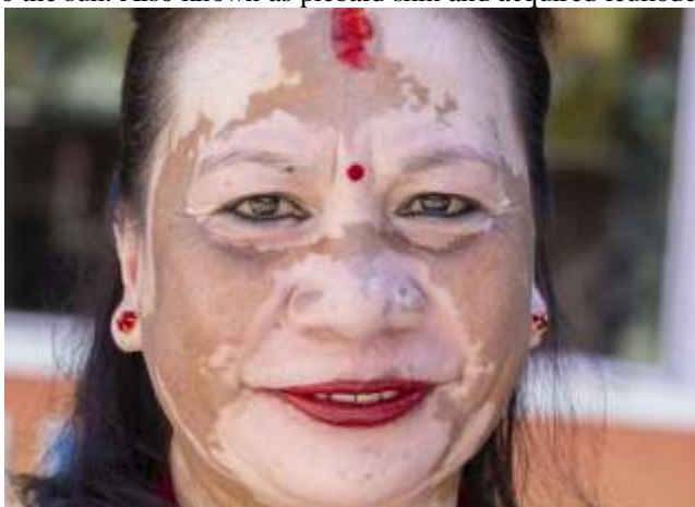
Image: Asian with Vitiligo

grows in areas affected by vitiligo may also turn white. The skin is not otherwise damaged. People with vitiligo must protect their skin from exposure to the sun. Also known as piebald skin and acquired leukoderma.