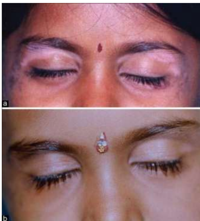
Image: a is before treatment b is after Treatment

Most common therapy in vitiligo involving <10% of the body surface area is with topical steroids. Clinical response and the repigmentation with topical steroids are almost similar to that of topical tacrolimus. Steroid application causes atrophy of skin, telangiectasia, hypertrichosis and acne, but these are not seen with tacrolimus treatment.