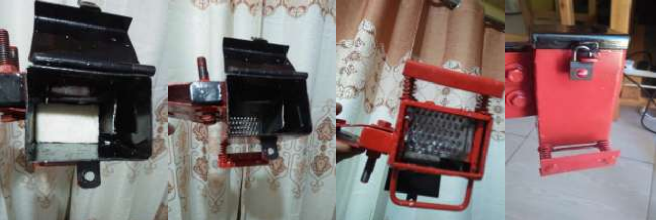
Fig3. The result of the bar soap shaver dispenser