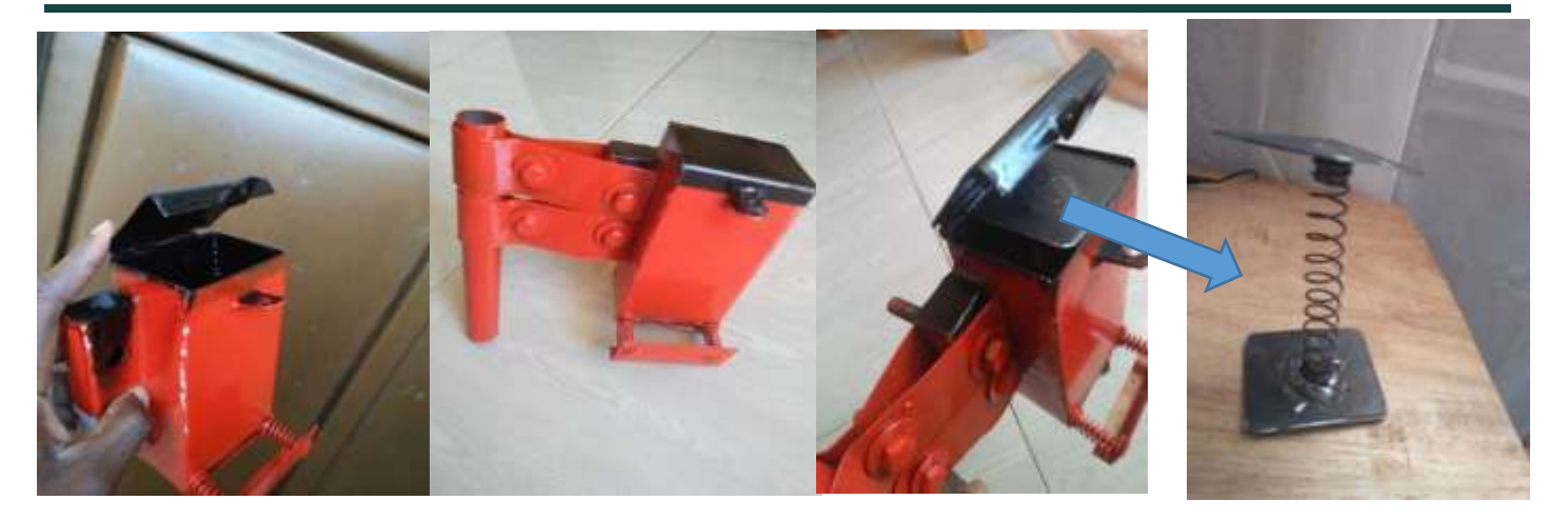
Fig2. The entire view of the bar soap shaver dispenser