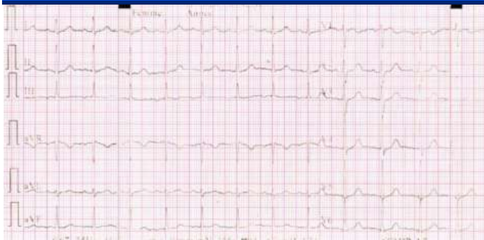
Figure 1 : ECG shows no significant ch