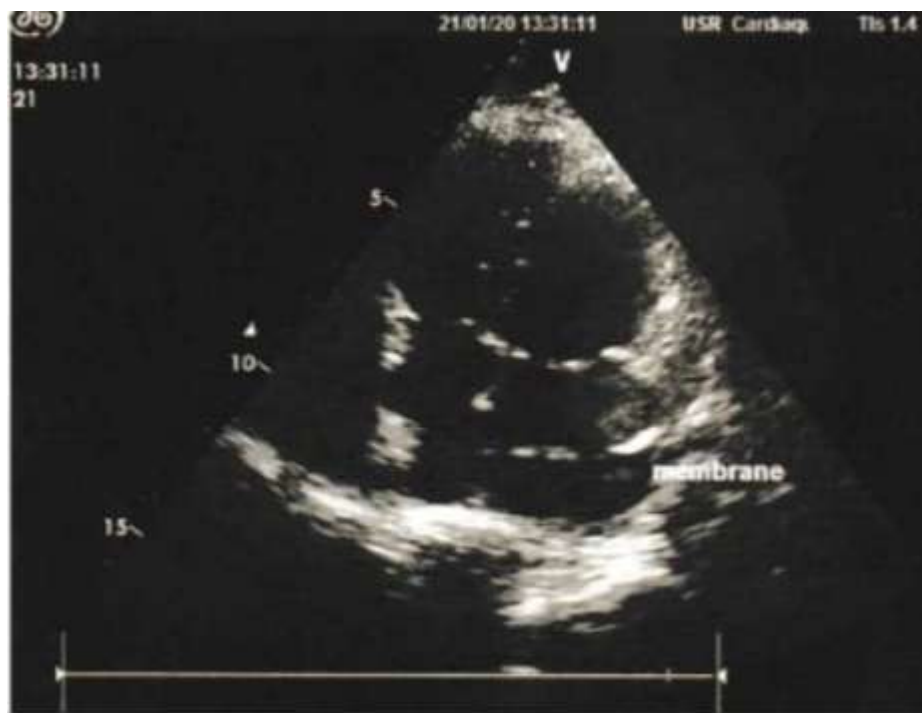
Figure 2: Image échocardiographique montrant une membrane non obstructive séparant l'oreillette gauche en deux parties inégales.