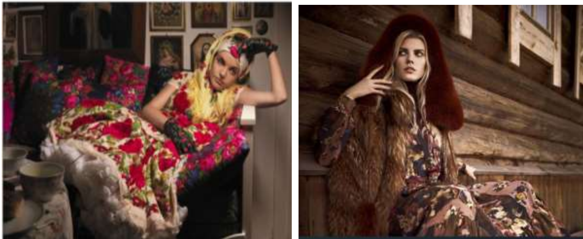
Figure 7. Russian style in clothing embodies wealth and beauty

Russian traditional clothing occupies a special place in the hearts of designers, especially for the abundant use of embroidered elements, buttons and colorful motifs. The choice of fabrics is full of variety: silk, linen, cotton, satin and velvet, cloth and even lace, which were additionally decorated with embroidery, beads, numerous stones, fur inserts and fringes.