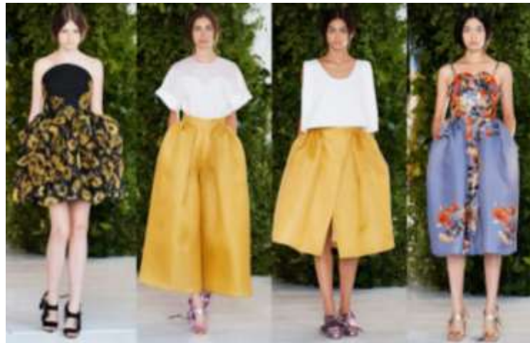
Figure 5. Egyptian ethno-style involves the use of natural colors

The main rules that designers adhere to when creating clothes – giving maximum comfort and naturalness. For the first time, the ethnic style of clothing was promoted among hippies. Hippie style in clothing is not just an image, it is a whole philosophy of life.