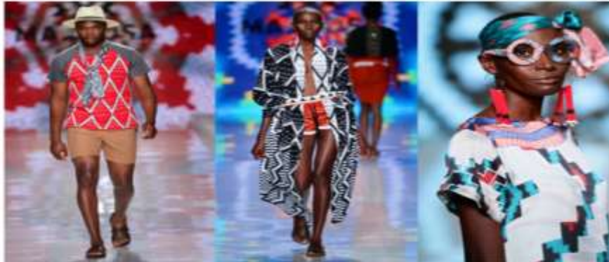
Figure 2. Ethnic style of Africa

The stylistic findings of the above-mentioned masters have left their mark in the modern collections of current designers, who also paid attention to traditional folk costumes. Of all the ethnic elements included in a modern costume, jewelry is preferred. The main directions of the ethnic style are considered Egyptian, Greek, Native American, Slavic, Indian, African and Japanese.