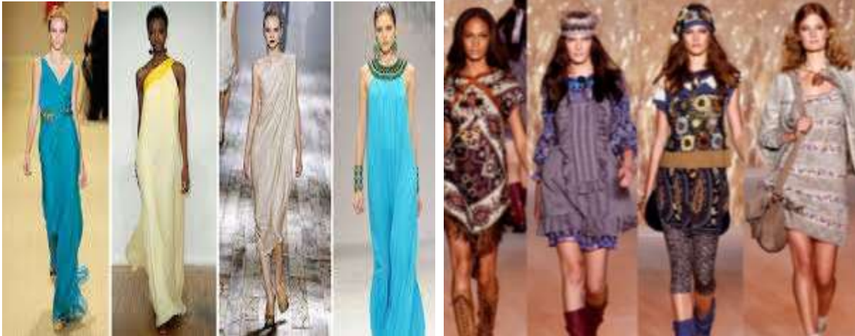
Figure 4. Classical folk clothing of various countries (India, Russia, Egypt, Greece, etc.) is increasingly used to create modern collections and fashionable bows.