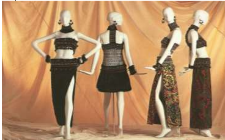
Figure 1. Ethnic style by Yves Saint Laurent

Ethnic style in clothing first surprised from the catwalk in the 10s of the XX century. It was then that the famous designer P. Poiret showed the whole world an extraordinary collection of clothes in the East Asian style. As some say, it was the ballet Scheherazade that inspired his ethnic style.