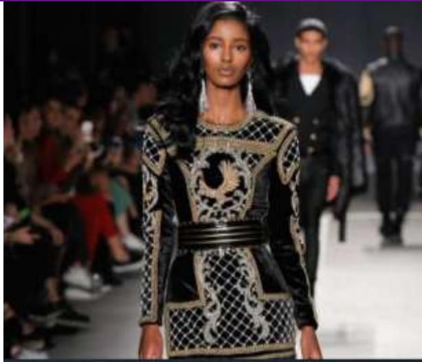
Figure 6. Ethnic collection from Balmain

Russian traditional clothing occupies a special place in the hearts of designers, especially for the abundant use of embroidered elements, buttons and colorful motifs. The choice of fabrics is full of variety: silk, linen, cotton, satin and velvet, cloth and even lace, which were additionally decorated with embroidery, beads, numerous stones, fur inserts and fringes.