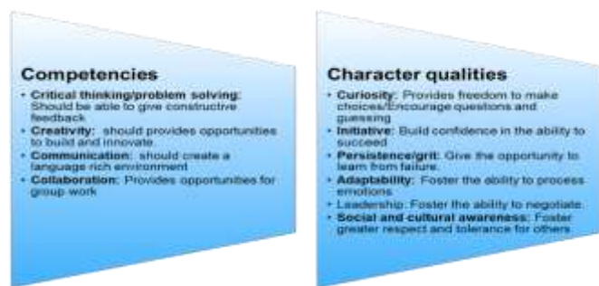
Table 1: The 21 st century competencies and character qualities

The meaning drawn from the survey and reflections supported the development of such skills through the interpretive lens provided in the constructionist learning environment as outlined in table 2.