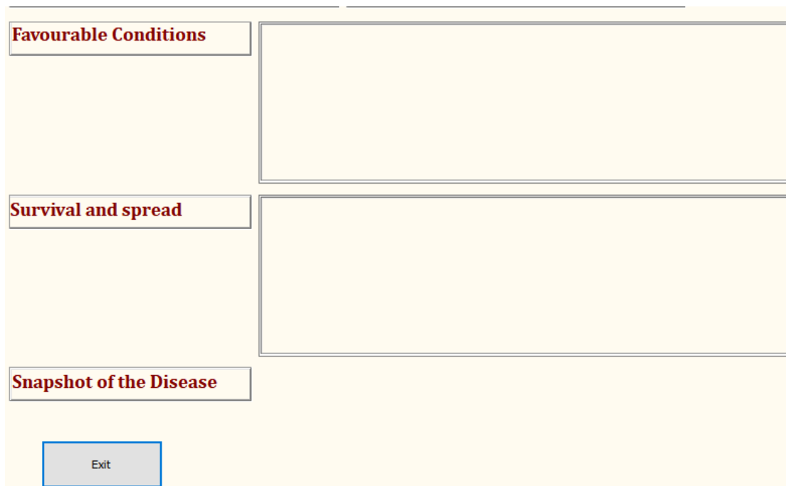
Figure 4: The figure shows diagnosis and recommendation of the expert system.