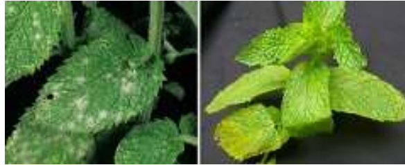
Figure 8: The figure shows Powdery mildew disease.

Powdery mildew: Powdery mildew is often severe on Persimmon grown in the greenhouse due to humid, shady conditions. Persimmon infected with powdery mildew is sensitive to winter injury. Powdery mildew appears on Persimmon leaves, stems, and petioles as a powdery, white to gray coating of fungal mycelium and spores.