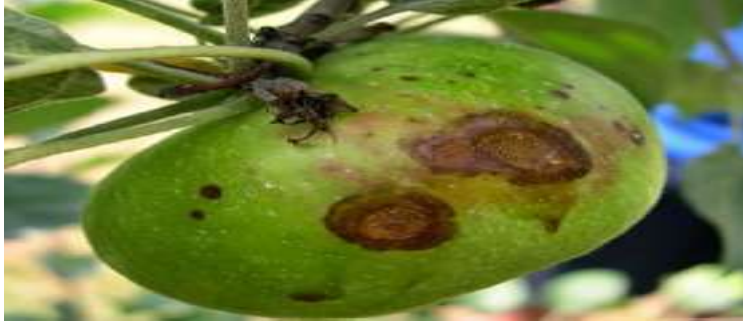
Figure 10: The figure shows Stem and Bitter rot.

The cause may be for this disease is the presence of these four conditions: