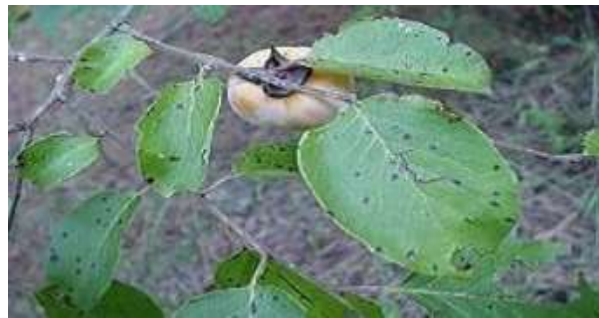
Figure 11: The figure shows leaf spot disease.

Leaf spot: Septoria leaf spot is a foliar fungal disease of Septoria species. Moderately warm temperatures and prolonged humid conditions favor the fungal problem. The fungus Septoria lycopersici is to blame for the black spotting on most Persimmon plants' foliage.