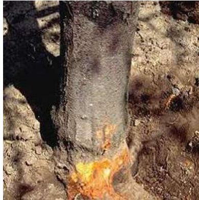
Figure 6: The figure shows Root rot disease.

is a serious disease of pepper Persimmon in the Pacific Northwest. Once the fungus is established in a field, oil yield may be reduced, stands may decline, and the ability of Persimmon plants to compete with weeds may be reduced. Infected plants eventually die.