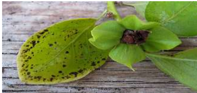
Figure 9: The figure shows Black Stem Rot disease.

: Black stem rot is considered a moderate to serious problem in Persimmon production. The fungus is most active during periods of cool and wet weather. Symptoms of infection include dark brown or black cankers on stems. Cankers may girdle the stem and cause plant parts above the infection to wilt and die.