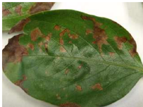
Figure 7: The figure shows Cercospora leaf spot disease.

, also known as "leopard spot". The fungus causes small, sunken brown spots to appear on the lower leaves and stems. These spots enlarge to form oval lesions with light gray centers and reddish-brown borders and may unite.