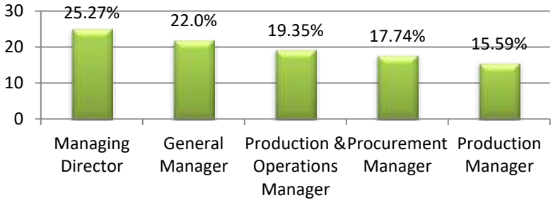
Figure 4.4: Showing Job description held in Industry

The research also sought to know the job description of the respondents. The findings are shown in table 4.4 below: