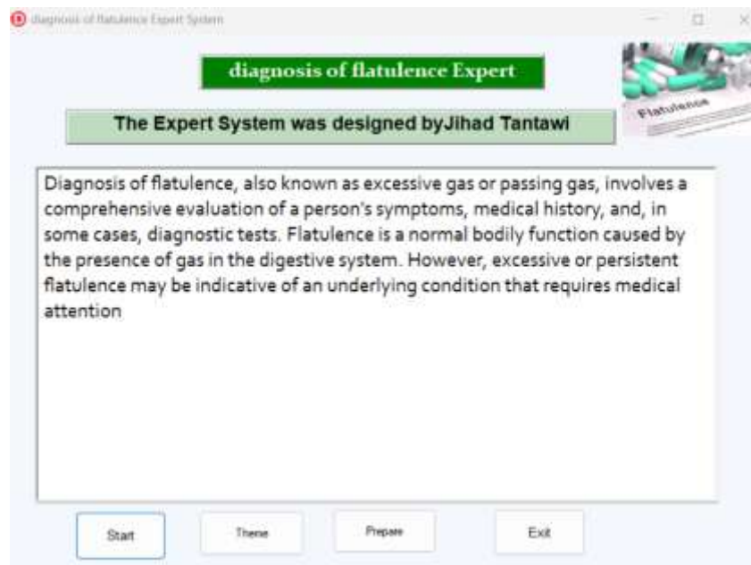
Figure 1 : user interface

At first, a user interface will appear that contains four tasks. If the user clicks on the "Start" icon, the user will see an interface that contains a list of all the symptoms. The user will choose all the symptoms related to the disease he wants.