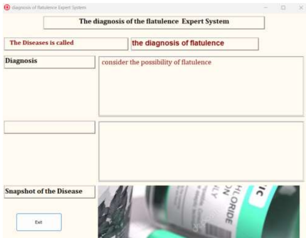
Figure 3 : Diagnosis of the disease

Then appear list about destination analyze to show the symptoms for the user to show the Favorable Conditions and Survival and spread.