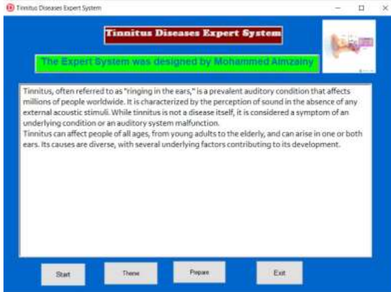
Figure 1: Welcoming Interface.

comprehensive and user-friendly expert system for diagnosing tinnitus diseases.