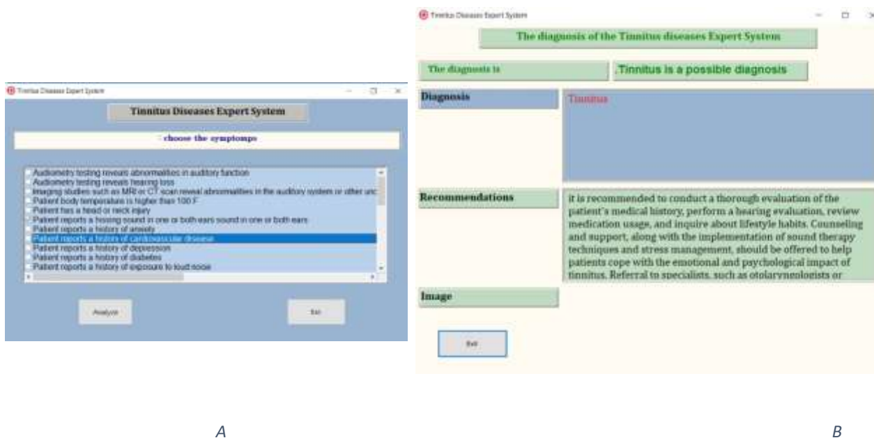
Figure 3: A: The Selected Symptoms, B: The Analysis Interface Result.

The inference engine of the expert system was implemented using the CLIPS (C Language Integrated Production System) programming language, known for its suitability in developing rule-based systems. CLIPS provided the necessary framework for constructing the inference engine, which employed a set of rules based on expert knowledge to make diagnoses. The use of CLIPS facilitated the efficient processing of user inputs and the generation of accurate diagnoses.