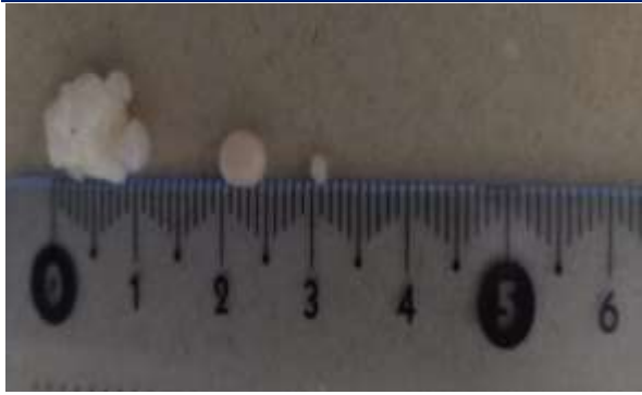
Figure 1. Size of hydrocele stones White hydrocele stones